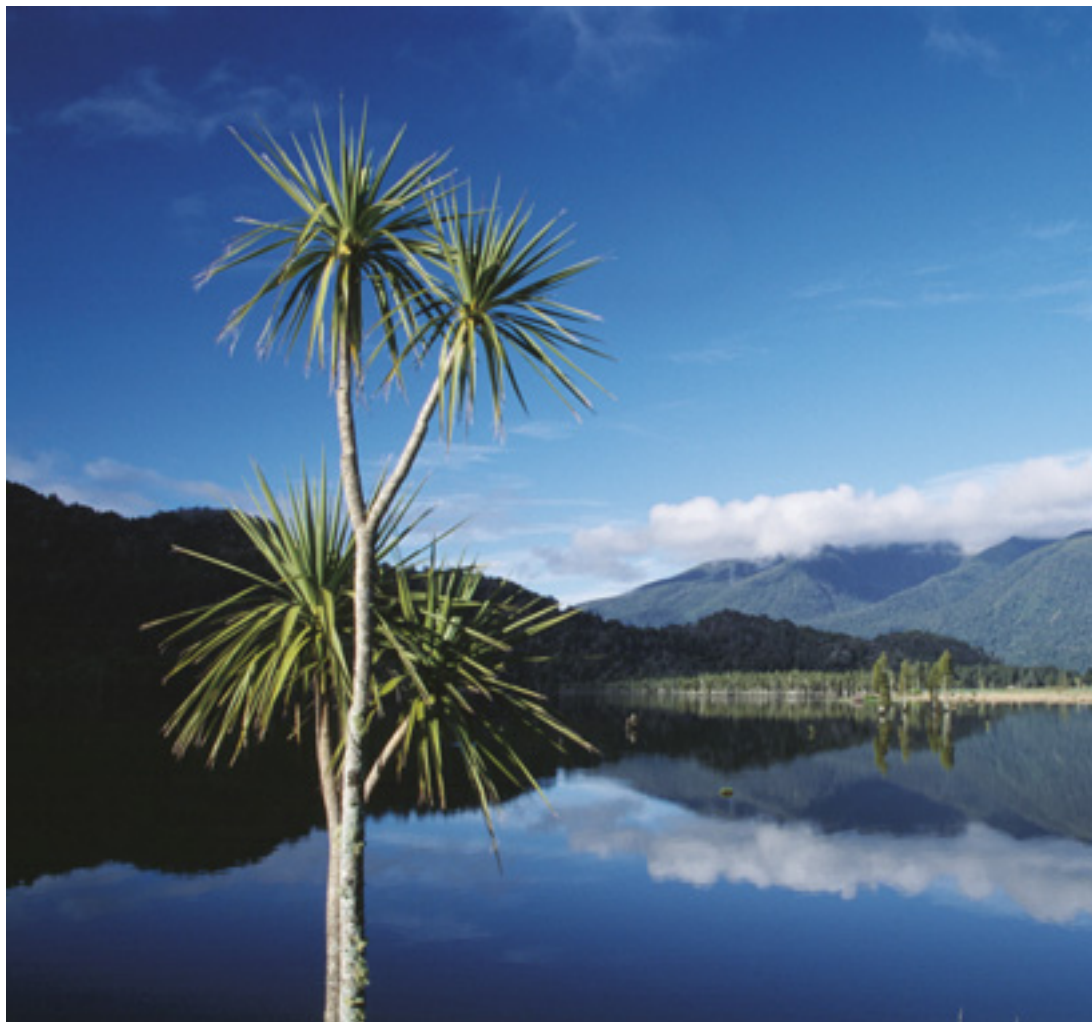
Photo credits: Cover, Tui - PhotoNewZealand.com/Yvonne van Leeuwen; Inside cover: Lake Poerua - PhotoNewZealand.com/Lawrence Smith

233 Cambridge Terrace, P O Box 167, Christchurch, New Zealand, Telephone 03 365 0000, Facsimile 03 379 8616